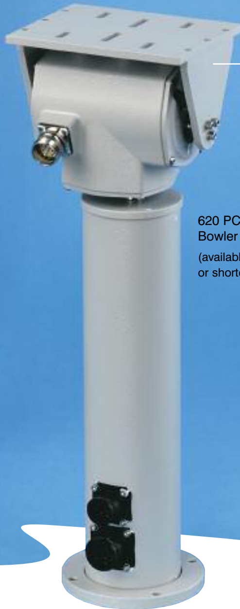
620 PCR Bowler (available with standard or shortened column)