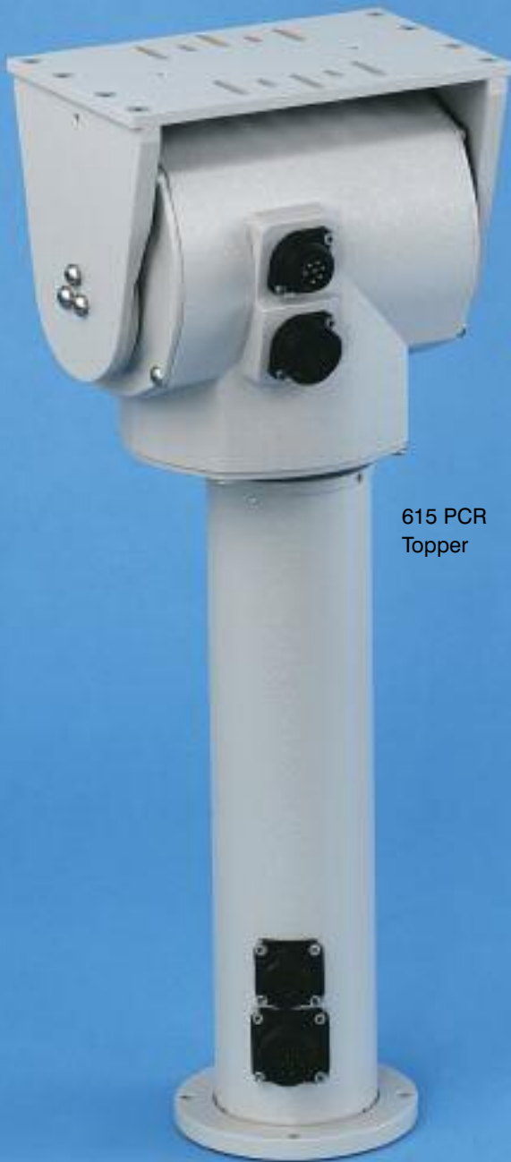
615 PCR Topper